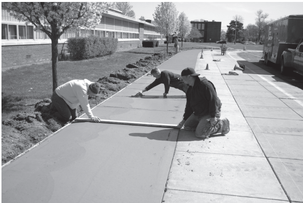
The local team from Martin Concrete Construction Company (based in Olmsted Falls) worked on the Falls-Lenox sidewalk expansion project over spring break in late March.