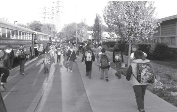
Students returned to a safer, wider walkway at the Falls-Lenox bus transportation hub thanks to funding from the recently passed P.I. Levy.

At its regular monthly meeting in April, the Olmsted Falls Board of Education authorized the advertising and receipt of competitive bids for six permanent improvement projects.