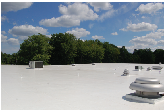
The academic wing of OFHS received a new roof this summer during the second phase of roof replacement for the building paid for with funds from the District's 5-year Permanent Improvement Levy passed in November 2011.

Funds from the 5-year 2.8 Mill Permanent Improvement Levy, passed in November 2011, continue to benefit scheduled improvement projects throughout the District. Generating 1.4 million annually ( for a duration of 5 years ), these critical P.I. funds are able to cover the costs of ongoing needed improvements which previously would have to have been paid for through the District's general fund. Use of P.I. Levy funds for projects/purchases with a useful life of five years or more have helped to significantly stretch the District's general fund and push out the need for the next operating levy. At the time the P.I. was passed, there was NO INCREASE to the existing level of school taxes due to a corresponding tax drop-off. Across the District, P.I. projects completed this summer include: