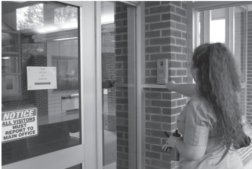
New buzzer entry system installed at Falls-Lenox.

Work also got underway to install new secure buzzer entry systems at the main entrance doors of Falls-Lenox, the Early Childhood Center (ECC) and the High School. The Falls-Lenox system was completed and operational before the end of this school year. The front entry security upgrades at the ECC and Olmsted Falls High School will be completed over the summer and will be fully operational for the start of the 2013-2014 school year. Funds from the Permanent Improvement Levy (passed in November 2011) are being used for these important improvements to building safety.*