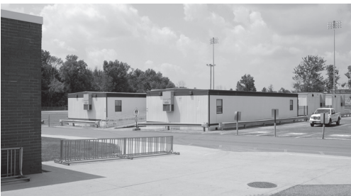
Four modular trailers house eight classrooms for OFHS students at the edge of the west parking lot.

The safety and security of students and staff is the top priority of Olmsted Falls School District. The recent community phone survey, conducted on behalf of the Olmsted Falls School District by Rocky River-based Triad Research Group, provided an opportunity to discuss school safety, among other topics, with a broader community audience – beyond our staff, students and parents. The data gathered reinforced that our community shares our District's desire to continually look for ways to maintain and improve upon school safety.