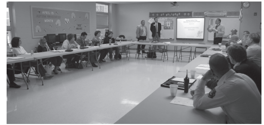
Members of the District Safety and Security Committee met with PLE Group three times.

Prior to the community phone survey, Olmsted Falls School District contracted with an outside security company specializing in school safety, PLE Group, to conduct a detailed and formal evaluation and updating of all building safety plans across the District. Also participating in this process, which took place throughout the course of last school year, was a committee including local elected officials and safety force leaders, parents and staff. Following a very comprehensive process including on-site audits and review of online safety survey data gathered from staff, parents and students, PLE Group made a number of commendations and recommendations. Many of these recommendations were able to be implemented immediately.